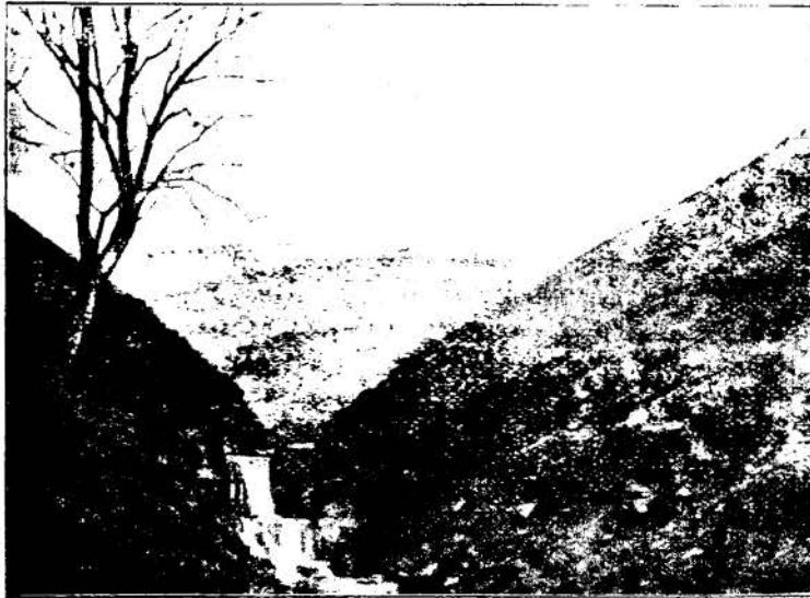
(VIEW IN WILLIAMS CLOUGH).

THE Committee of the Society is glad to report that the agreements in regard to the right of way from Hayfield to the Woodlands over the Mill Hill Shoulder of Kinderscout are now complete, and that the footpath is being marked out as arranged.