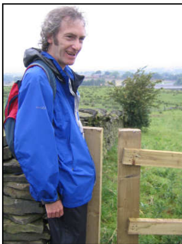
An impossibly narrow gap stile