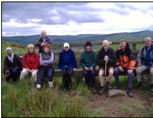
On Whaley Moor near Dipping Stones

With a not too encouraging weather forecast it was a case of whether or not we could complete the walk before the rain came. In the event, we managed it in perfect conditions. A group of 10 set off from Whaley Bridge Railway Station along the main road towards the superstore turning left under the Railway Bridge and up towards the hamlet of Hockerley. From here we made our way across a field and down Yardsley lane passing the Hall before joining a